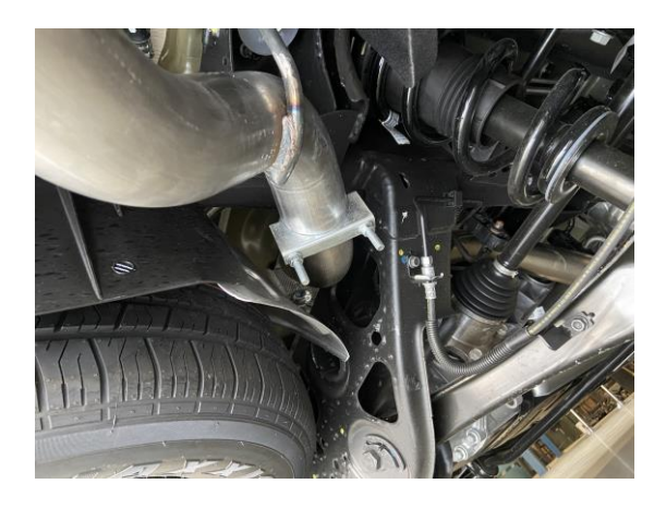
3. Install exit pipe #a onto stock pipe. Use clamp #b, do not tighten.