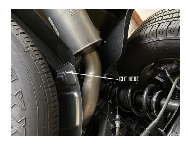
2. Lay out the exhaust on the floor so it looks like the drawing and compare parts with manual. To remove the stock exhaust, you'll need to cut it where indicated in the photo above. (Factory rubber hanger grommet will be re-used, use wd-40 to aid in removal.)

1. Disconnect the negative battery cable before removal of OEM exhaust. This will allow the computer to reset and recognize the new exhaust. Lay out the exhaust on the floor so it looks like the drawing and compare parts with manual.